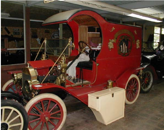
(1912 Ford Calliope)

One of these was a one-off RR & AACA 1st, but we still have 2 cars which were AACA 1st, and 3 one-off cars. We still have: 1904 Riley (3 wheel, 2-passenger in tandem), '05 Armac , '08 Sears, '08 Buick model 10 (re-bodied as racer), '09 REO, '11 Cadillac Limo, '12 Ford T delivery, '13 Woods Mobilette, '13 Metz, '13 Overland '14 Hupmobile, '14 Woods Mobilette, '15 Woods Mobilette, '16 Milburn (electric), '16 Saxon chassis, '17 Saxon, '21 RR, '24 Hupmobile (3dr sedan), '27 Chrysler (which I'm about to sell), '28 Custer Car (elect), '28 Hudson (custom bodied), '29 Studebaker Housecar, '34 BSA (3 wheel). Motorcycles include a '12 Yale, '20 Indian Power Plus, '30(?) Servi-cycle and a '32 Excelsior.