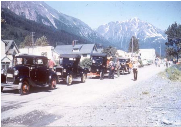
(Lined up in 1961 for Seward Parade)