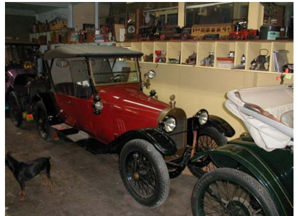
(1915 Woods Mobillette in our museum)