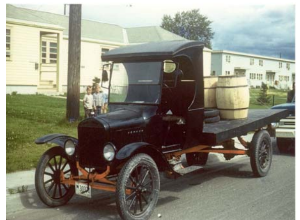
(Heavy duty truck sitting in front of my quarters at EAFB)