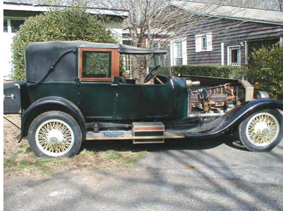
(1921 Rolls Royce Silver Ghost)

Last Sunday my older son who now lives in Anchorage (for the third time), visited your car show and took pictures for me. I received them last night along with your web site information.