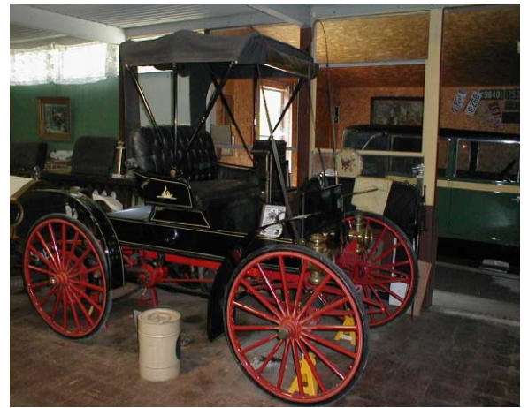
(1908 Sears Autobuggy)

Within 6 month, I returned to NY, bought the '20 RR and drove it to SC. Then I bought a 1939 RR, and two 3-wheelcars - a 1930 Morgan and a 1934 BSA all within the first 2 years in SC. Followed this with two motorcycles, a '12 Yale & a '32 Excelsior. In 1968, by accident, I acquired two Phantom III RRs and decided some had to go - so sold the Elec, Franklin, '39 RR and the two Phantom-IIIs - why - because the government wanted me to move to Florida, which I did in '71. Between '71 and '75 I acquired a 1928 Custer car, '20 Indian and '30 Servi-Cycle and 1913 Metz.