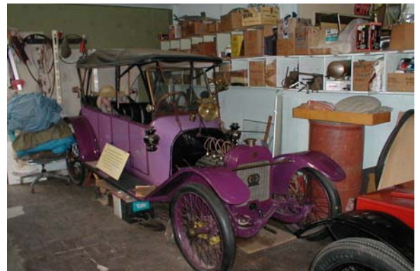
(1913 Woods Mobillete)

construction system with headquarters just a couple miles away. On this visit, I found two adjacent buildings which had been county school, but now just sitting empty: Betty, the boys and I talked it over and decided to buy and rehab them, and bring together all the cars and different antique items we had collected in 50+ yrs. under the two roofs.