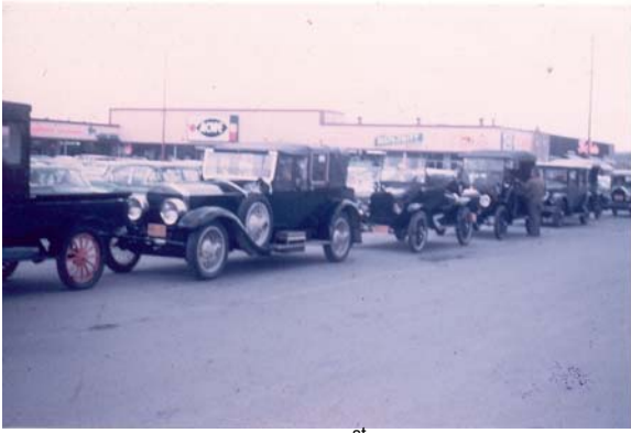
(Off to Palmer for the 1 st State Fair in 1961)