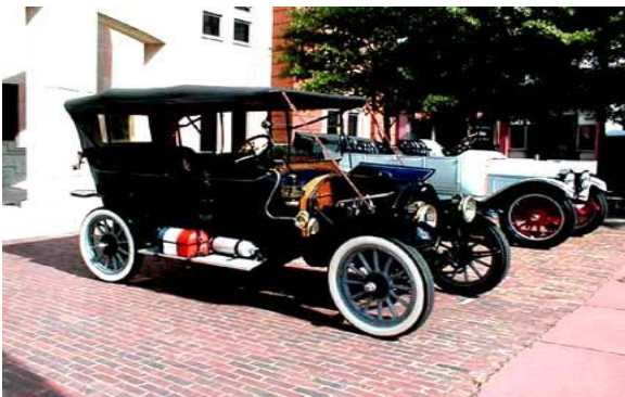
(1913 Overland Tourer parked outside our museum)

Then up came the health problem again - and the government said I had to retire which I did on the last day of Feb 1976. So what to do with all the thing we collected - cars and antiques of all kinds. I was told 6 months before I was forced to retire, that the event would occur. In that period, we came up from Florida to Clemson University see the boys - the older one a Professor at the university, the younger one running a department in a large international