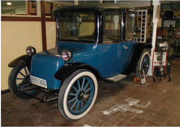
(1916 "light" Milburn Electric)