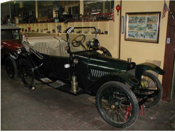
(1914 Woods Mobillete)