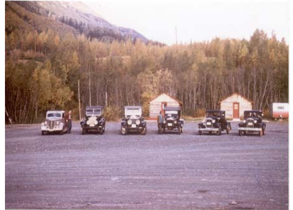
(Fall Tour to Alyeska, 1961 photo)