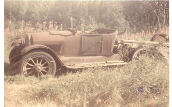
(Car we tracked down in the valley)

a lady who had a 1919 model "T" coupe up on blocks, had 202 miles on it, never been in the rain, and a man who had been coming in from 1919 until 1945 to turn the engine over by hand and deflate and inflate all 5 tires with a hand pump. 1919 was the first year for an electric starter as standard equipment, and the car also had factory slip covers on doors and seats. Paid $50 for it. People who knew both our families would cross the street to avoid me, thinking that I not only had my back fractured, but my head as well, for as you know, such cars were being used as scrap metal for the war. At the same time, we needed a bed to sleep in, and since Betty had no objection, I decided we would collect early American item to create our home furnishings - - thus I bought a most unusual rope bed made by the old Shaker sect - and to this day, we still sleep in it. Let me now shorten the story by saying our entire house - and when I lived in Elmendorf, unlike most housing, I had all my own furnishings, all antiques except for kitchen and bath - and today its still that way - children brought up on rope beds, 1850 furnishings, etc.