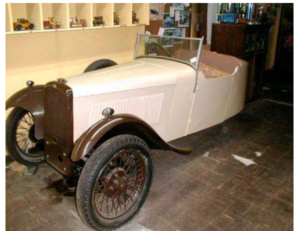
(1934 BSA three wheel)

In 1962 I was still having problems, and the government decided I needed to 'go home', and in July sent me to northern NY. In 1963, my Dad and I decided we ought to see the Housecar - so we flew out to California, looked at the car at midnight, drove it around the block the next morning and at noon that day, took off and drove this '29 9.5' high. 29' long car with French leaded windows - including a bay window in the rear bathroom - across the states. Problem then was storage - found a barn in the country near by and put it in there.