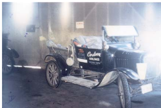
(Cordova Airlines Model T w/ 1914 tag)