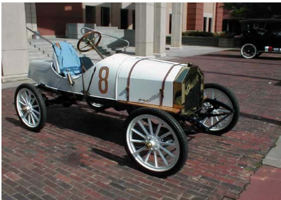
(1908 Buick Model 10 re-bodied as a racer)

Are you ready for more?? While driving the Elec, we found a nice 1923 Franklin 2-dr sedan. I had no more then bought it, when a rep for NY State came along and wanted the Franklin to be put in the NY State Exhibit being set up for the Worlds Fair - so I let them have the car. Now the government wanted me to move again, so I took our modern