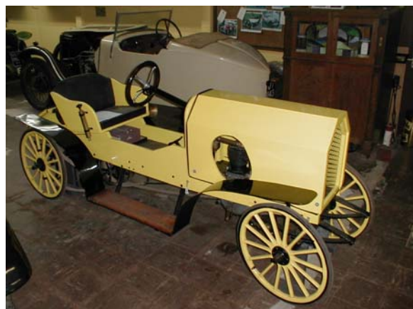
(1905 ARMAC with leather belt drive)